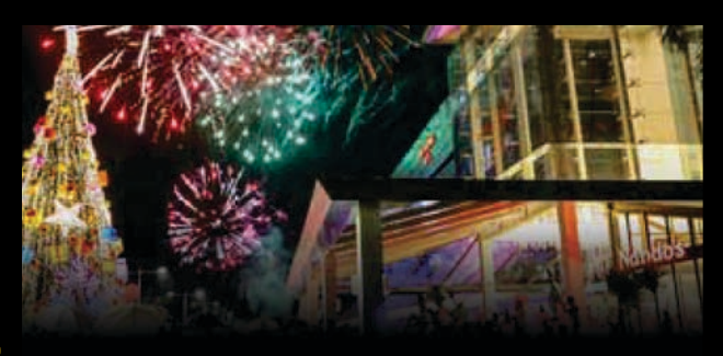
The Spring Shopping Mall, Kuching