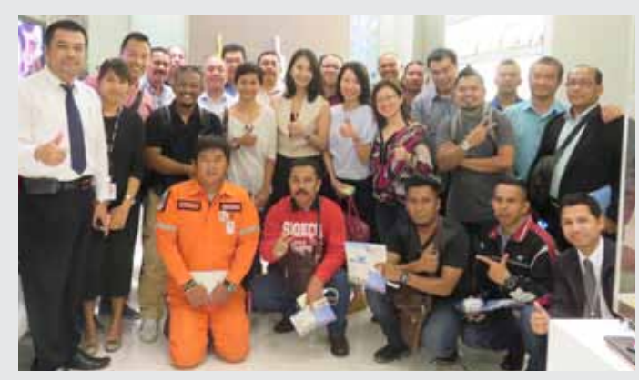
The Terminal 21 Operations team led us on a tour of their safety and security areas

During the third study trip to Bangkok organised by PPKM on 21-23 July, we had 21 participants visiting eight shopping malls with special focus on safety and security matters. The malls in the central business district were Terminal 21, Emporium/Emquartier, Central Embassy, Central World, Siam Paragon, Siam Center, and Siam Discovery, and one suburban mall, Central Festival Eastville.