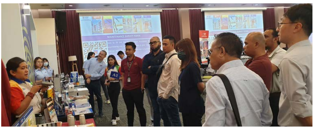
Nippon Paint does not only sell paints.

After the hiatus of the past few years, members were glad to be able to network again over a cuppa and were introduced to new materials and maintenance techniques at the Talk and Expo Tour hosted by NIPPON PAINT. Paint specialists shared about cost effective maintenance materials for waterproofing, flooring materials and other innovative refurbishment solutions.