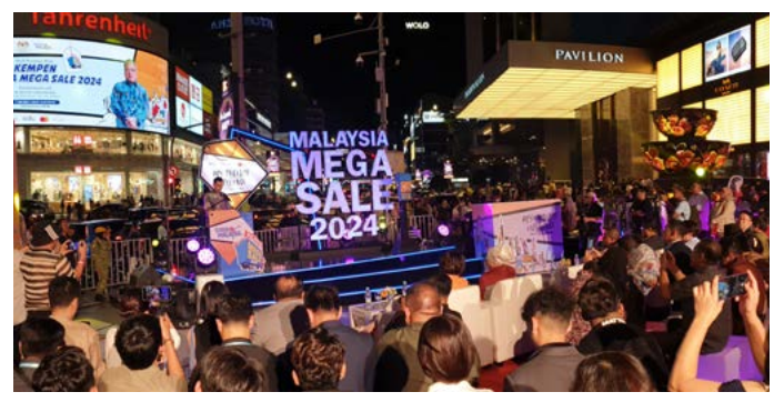
The first of two National Sales Campaigns was kicked off this year with the launch on 7 June 2024 at Pavilion Kuala Lumpur by Khairul Firdaus Akhbar Khan, Deputy Minister of Tourism, Arts and Culture.