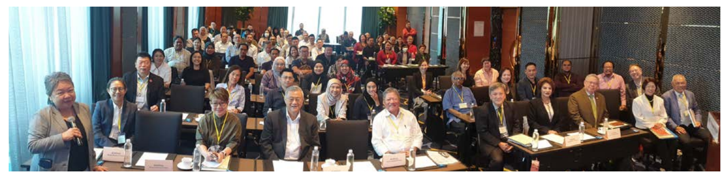
We are here to find solutions to the challenges in building management.

Our one-day seminar on building management co-organised with Building Management Association of Malaysia (BMAM) saw 67 participants in attendance who learnt about the importance of sustainability in building management, winning awards and amendments needed in the Strata Management Act 2013. Of particular interest to managers of strata properties, there were two case studies on multiple rates and common areas for strata building and this was wrapped up by practical tips on common areas.