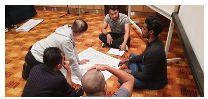
This workshop is starting to give me a headache.