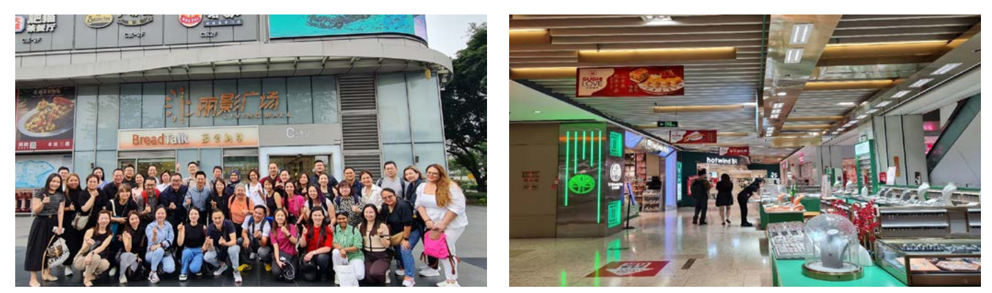
Living Mall is popular with the residents staying above the shopping podium which serves as their local retail therapy area.