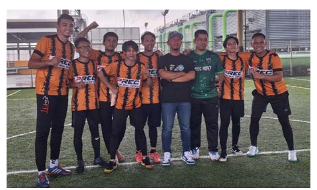
2nd Runner up: SACC Mall.