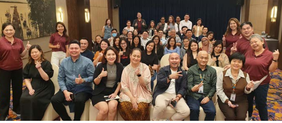
Cheerful and happy faces at Kuching.

Our central committee set out on the annual outreach meetings to Kuching and Kota Kinabalu on 24 May and 25 May 2024 respectively. There was a good turnout at both meetings and our current partnership with UOB Malaysia saw them helping to arrange for talks on E-Invoicing which we will all have to adopt soon.