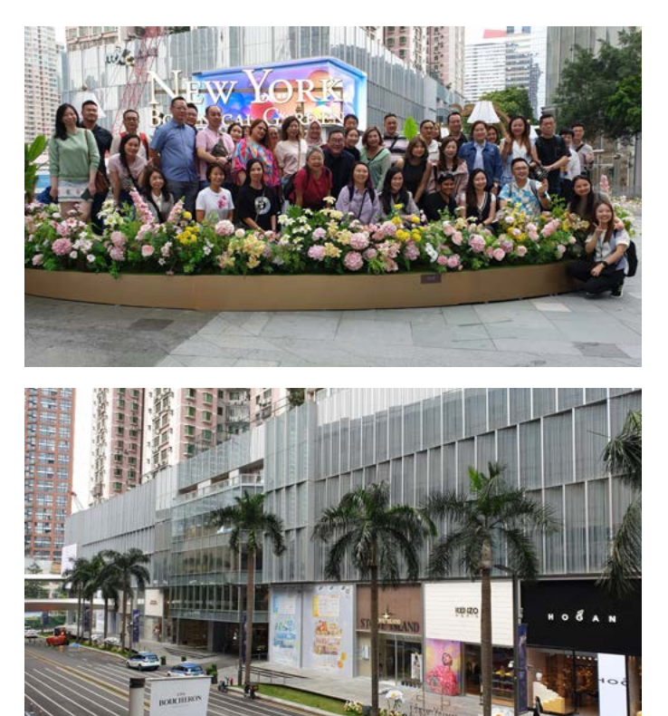
The MixC at Luohu was running a promotion with New York Botanical Gardens and our group took the opportunity to shoot the beautiful flowers.