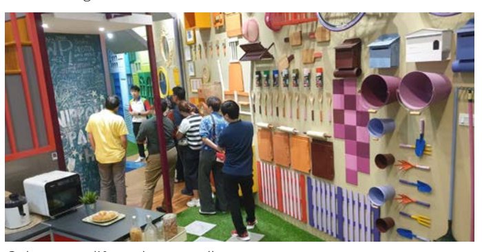
Colour your life and your malls.