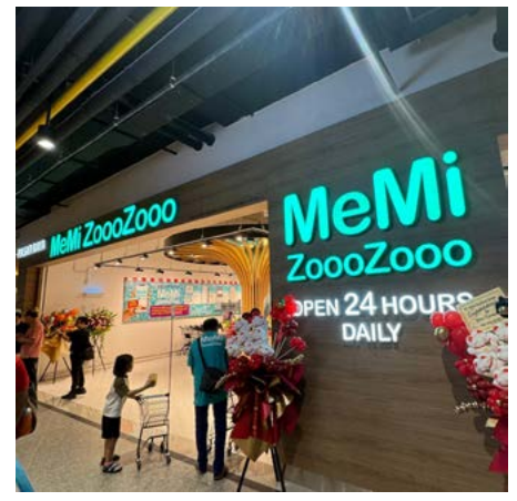
24-hour grocery concept