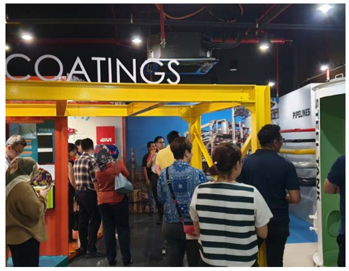
Paint will create an ideal environment for Elevating Aesthetics , Durability and Safety for shopping malls.