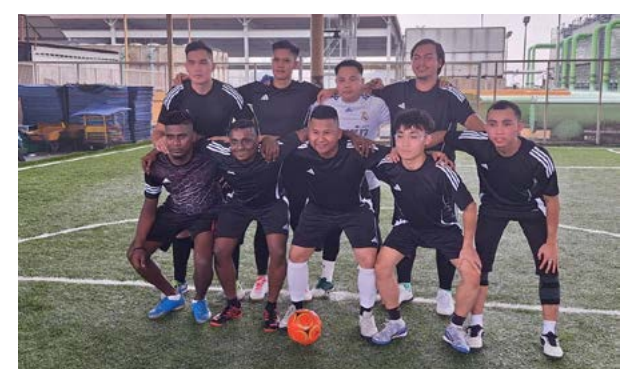
1st Runner up: Midvalley.