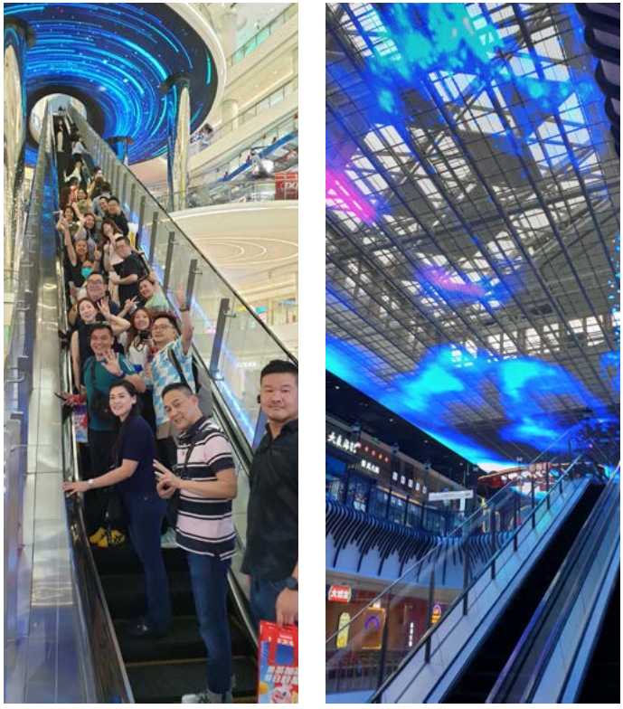
The unique feature at Wanda Plaza Longgang was this 64-meterlong 'flying ladder' spanning six levels and gives an impression of 'jumping to the sky'.