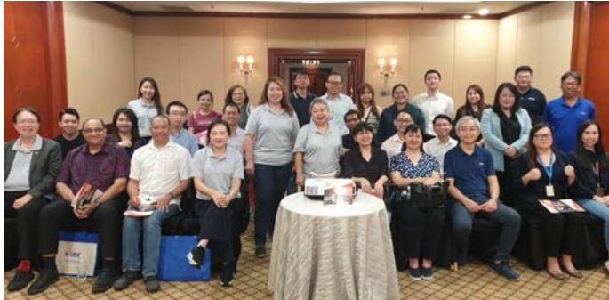
Mall members network at Sabah regional meeting at Sutera Harbour Resort, Kota Kinabalu.