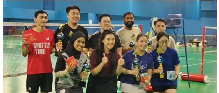
1st Runner Up: Mid Valley Megamall