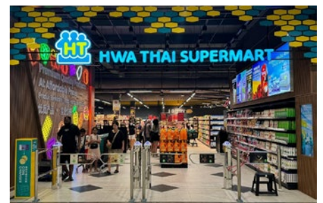
Your neighbourhood family supermarket

Developed with AirAsia MOVE, THE COMMUNE CIRCLE App not only updates its members on the mall's events but also offers them exclusive rewards, promotions and benefits such as winning return flight tickets to destinations that AirAsia flies to.