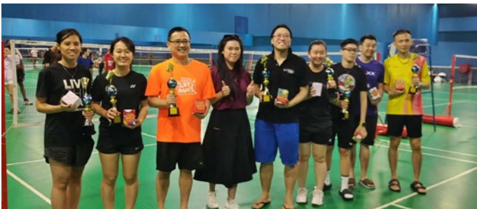
2nd Runner Up: LaLaport BBCC