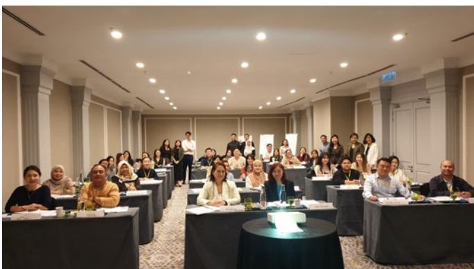
⤴ We are more seasoned - Marketing and Leasing Part 2