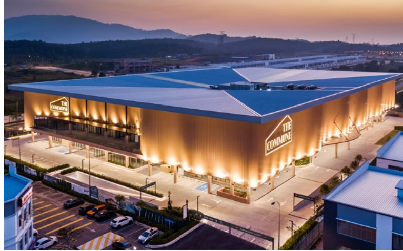
A lifestyle mall and community space