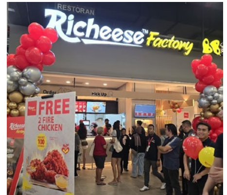
A beeline for its fire chicken

All points collected can be redeemed for the mall's shopping vouchers as well as flights on AirAsia network, hotel bookings on AirAsia MOVE platform and ride-hailing services through AirAsia Ride.