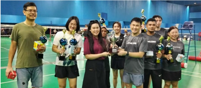
Champion: Sunway Pyramid

The 2024 competition garnered enthusiastic participation of 25 teams from 18 malls. Thank you IOI City Mall for your generous sponsorship.