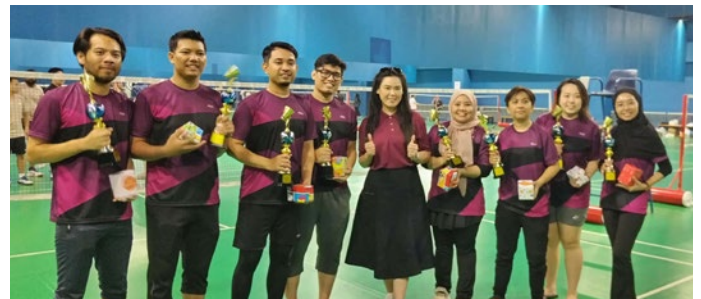
3rd Runner Up: AEON Mall Taman Maluri