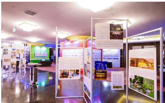
⌚ Conference exhibition panels also featured Malaysia's shopping malls