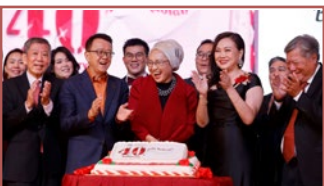
40TH ANNIVERSARY GALA DINNER