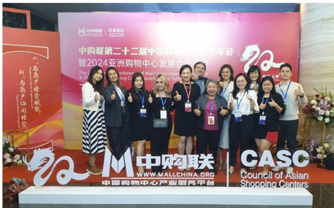
⌚ The three-day annual conference held in Shanghai saw 14 of our mall members in attendance from Suria KLCC, Stratos Pinnacle, Kompleks Metro Point and The Curve