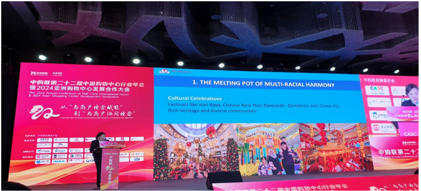
⌚ PPKM President presenting on the cultural perspective in Malaysia shopping malls