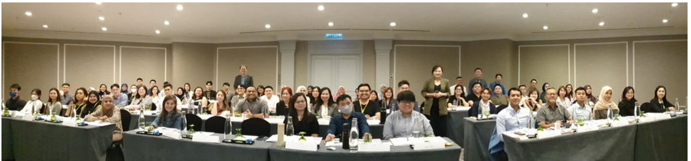
⤴ Enthusiastic participants of Marketing and Leasing Part 1