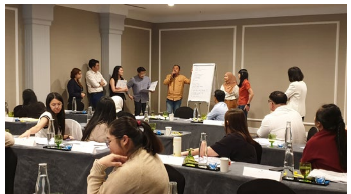
⤴ Practising our practical skills