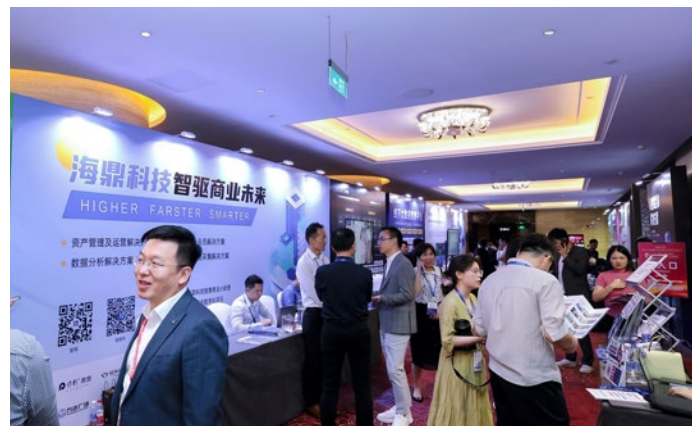
⌚ Exhibitors showcased new technology and trends in building operations in the China scenario