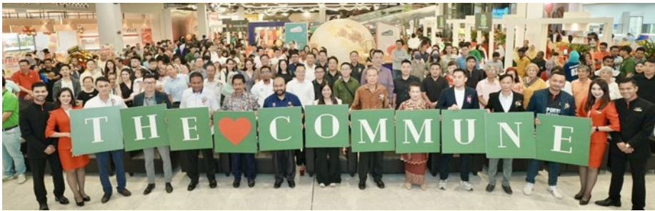
The VIPs and crowd at its opening

T HE COMMUNE lifestyle mall, which opened on 10 September, has redefined the shopping experience in the heart of Indahpura in Kulai, Johor with its diverse, new brands, world-class amenities and exciting rewards for shoppers.