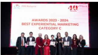
PPK MALAYSIA AWARDS 2023 - 2024