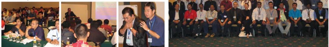
▲ On target, the turn out was good!

Striding ahead with the annual training seminar, the recent session saw an attendance of 40 security and safety personnel picking up tips from our long-time in-house security and safety personnel plus other trainers. As all the participants will tell you, it is indeed a golden opportunity to glean first-hand learning experience from these well respected and well-learned hands-on practitioners !