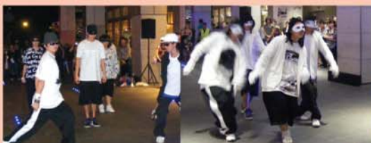
▲ Street performers strutting their stuff