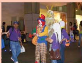
▲ The funny man in colourful costume ..