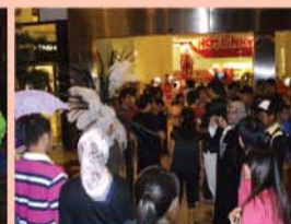
▲ The night owls painting the town-