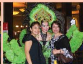
▲ Pretty belles make a pretty picture