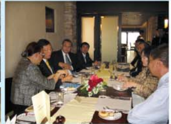
Luncheon talk. ▶