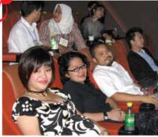
▲ Waiting in the wings.