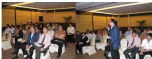
▲ The enthusiastic and responsive participants