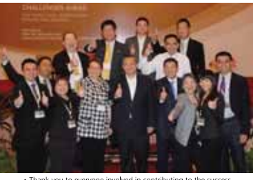
▲ Thank you to everyone involved in contributing to the success of the conference!