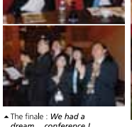
▲ The finale: We had a dream...conference!