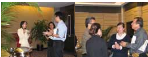
▲ Getting to know you