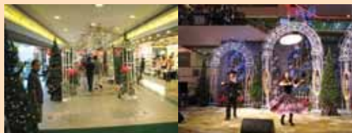
▲ An Enchanting Christmas Garden at Sungei Wang Plaza