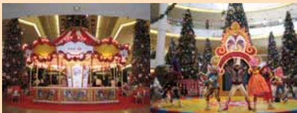
▲ Mid Valley Megamall does it again with A Christmas Carnival That Befits All