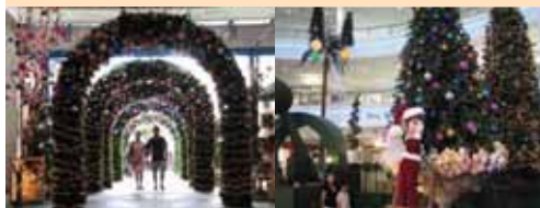
▲ The Curve's Garden Christmas