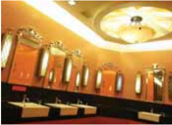
◀ Stylish, sparkling and most important, clean !