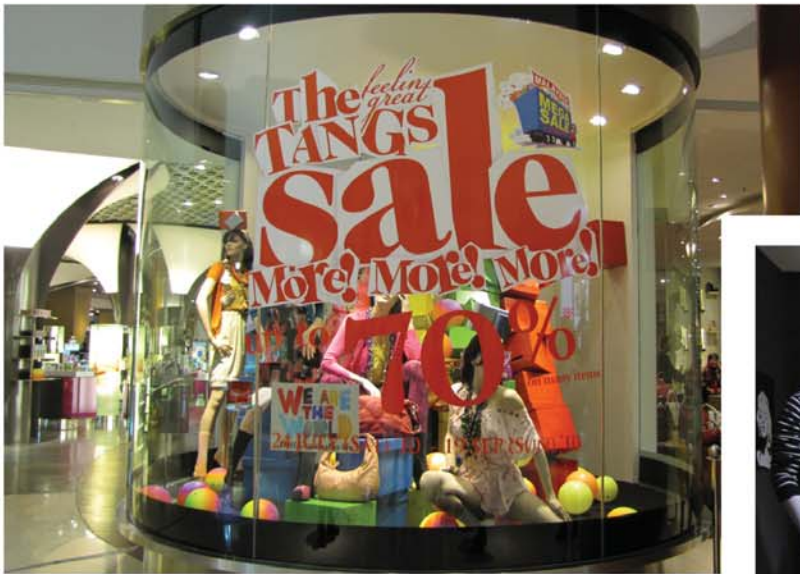
▲ Feeling great with 70% off at Tangs Pavilion