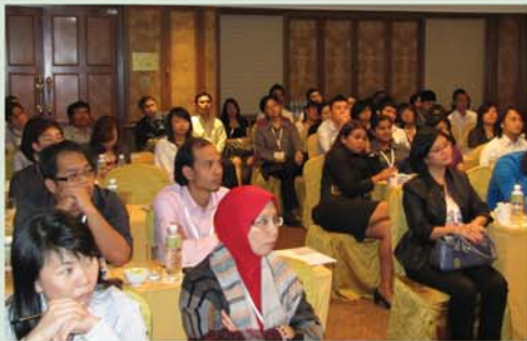
▲ Paying rapt attention