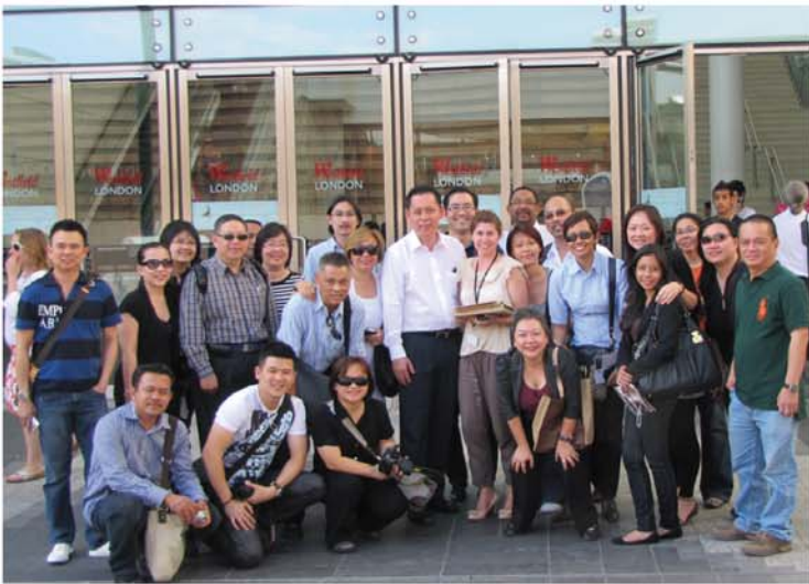
▲ Posing in front of Westfield London