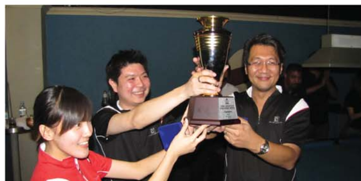
▲ Plaza Low Yat - we are the pool champions !