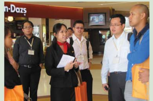
▲ Site visit at Sunway Pyramid