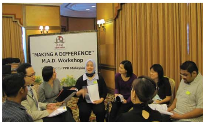
▲ Just me, getting to know you