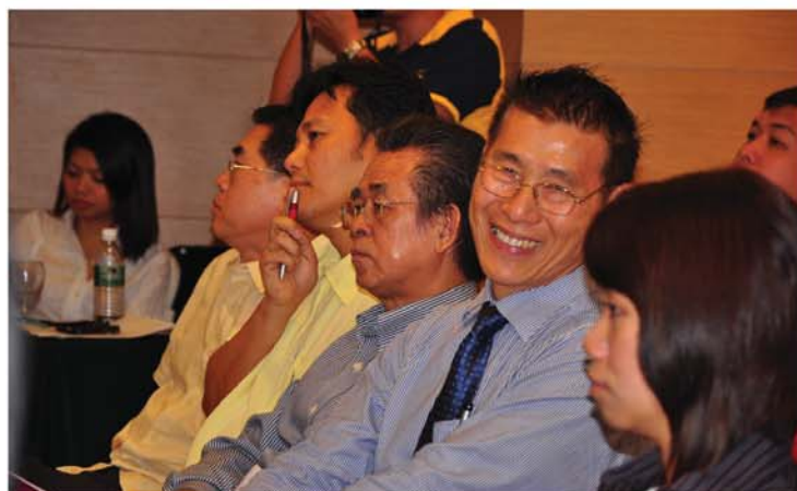
▲ Different moods – pensive, serious and so cheerful !