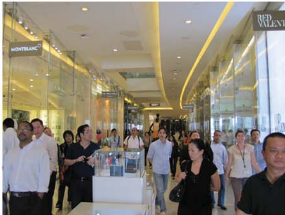
▲ The upmarket and couture wing at Westfield London