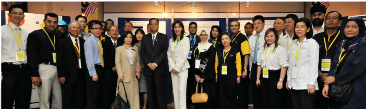
◀ The keypins of the Wholesale & Retail Lab

Update: NKEA Lab reports have now been submitted to the Cabinet for their consideration and approval; for those interested, watch out for forthcoming NKEA Open Day announcements