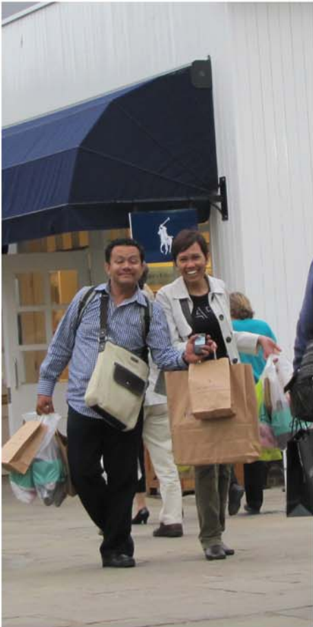
▲ Incurrable shoppers who need retail therapy

The general conclusion was summed up in a few succinct words: hectic but worthwhile, good networking, good selection of malls and value for money !