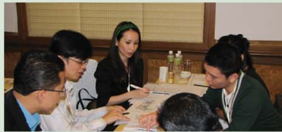
▲ Working out the case study is hard work! Marketing & Leasing Part 2: August 2010