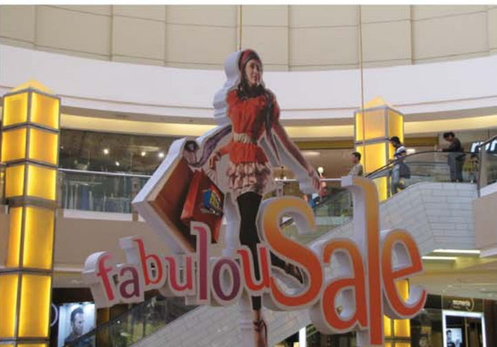
▲ It's a FABULOUSALE at Sunway Pyramid