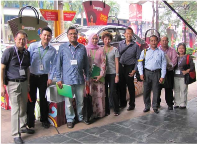
▲ The panel of judges and secretariat at Sungei Wang Plaza, trying to shop and win a car ?!