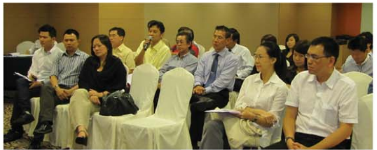
▲ Members share their queries