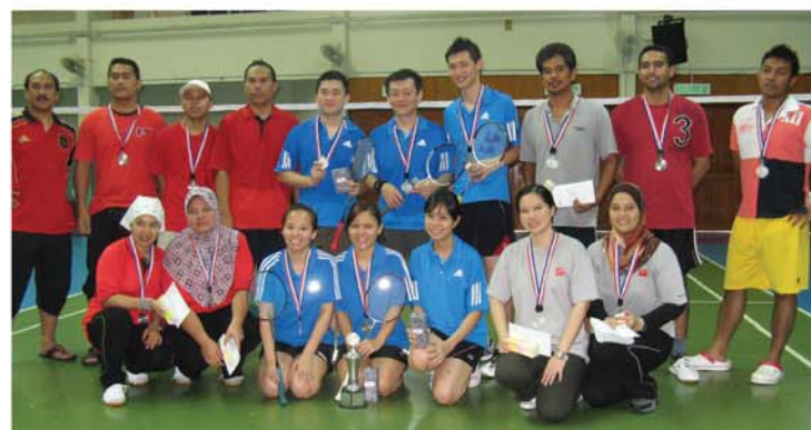
▲ It's all about teamwork and fellowship. The lion roars -- winning team for badminton in blue is Sunway Pyramid !