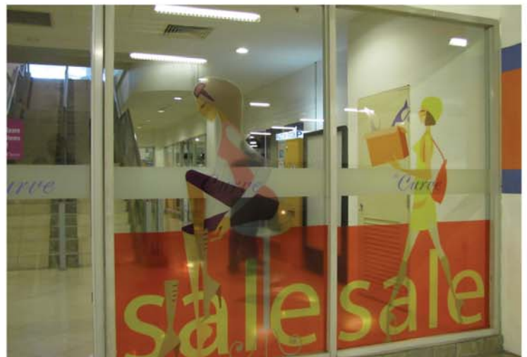
▲ 'Curvaceous' Sale at The Curve