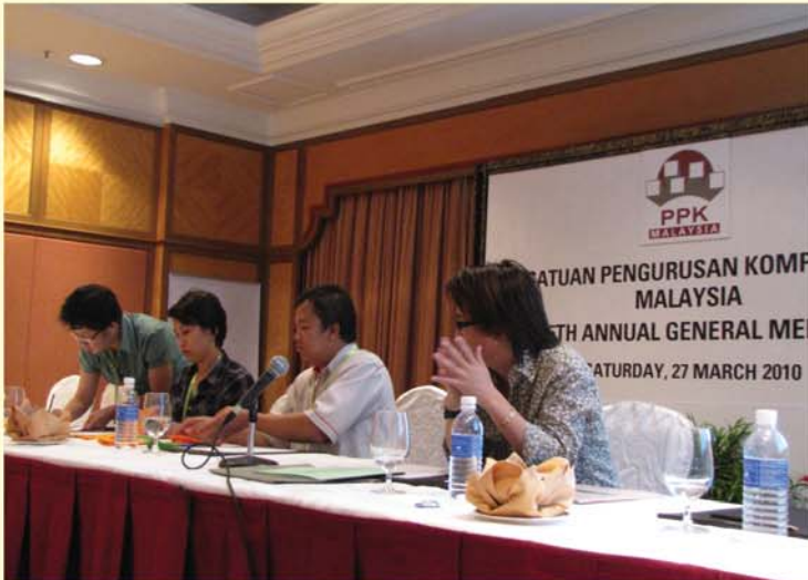
▲ Our responsible election officers checking the tally one more time ..