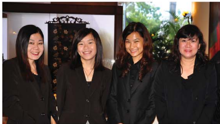
▲ Kudos to the Penang team