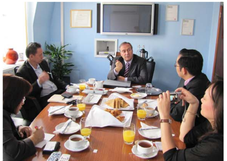
▲ It was a fruitful meeting with the British Council of Shopping Centres (BCSC)