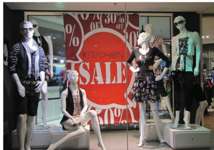
▲ Fashion on sale