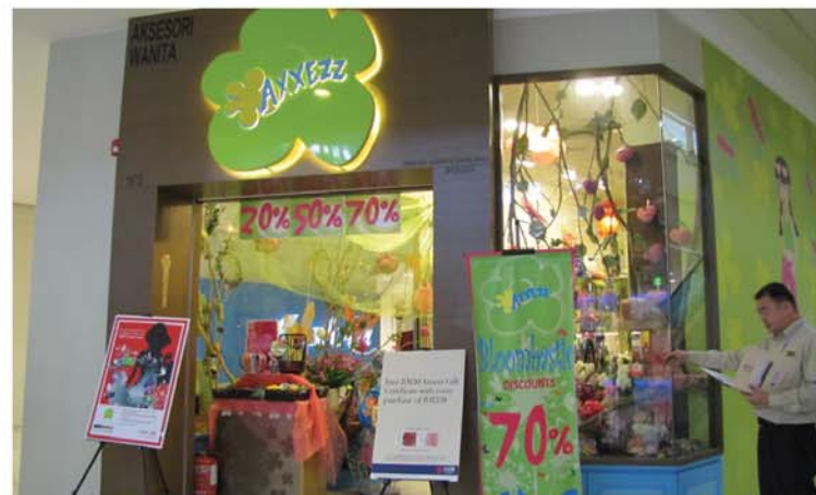
▲ 70% discount ? Bloombastic !