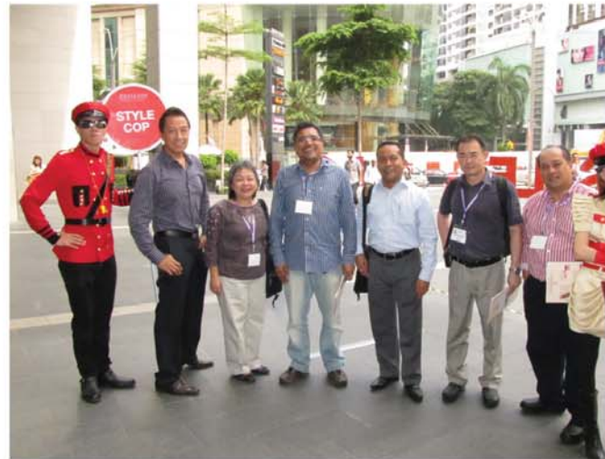
▲ Super Stylish Cops at Pavilion KL