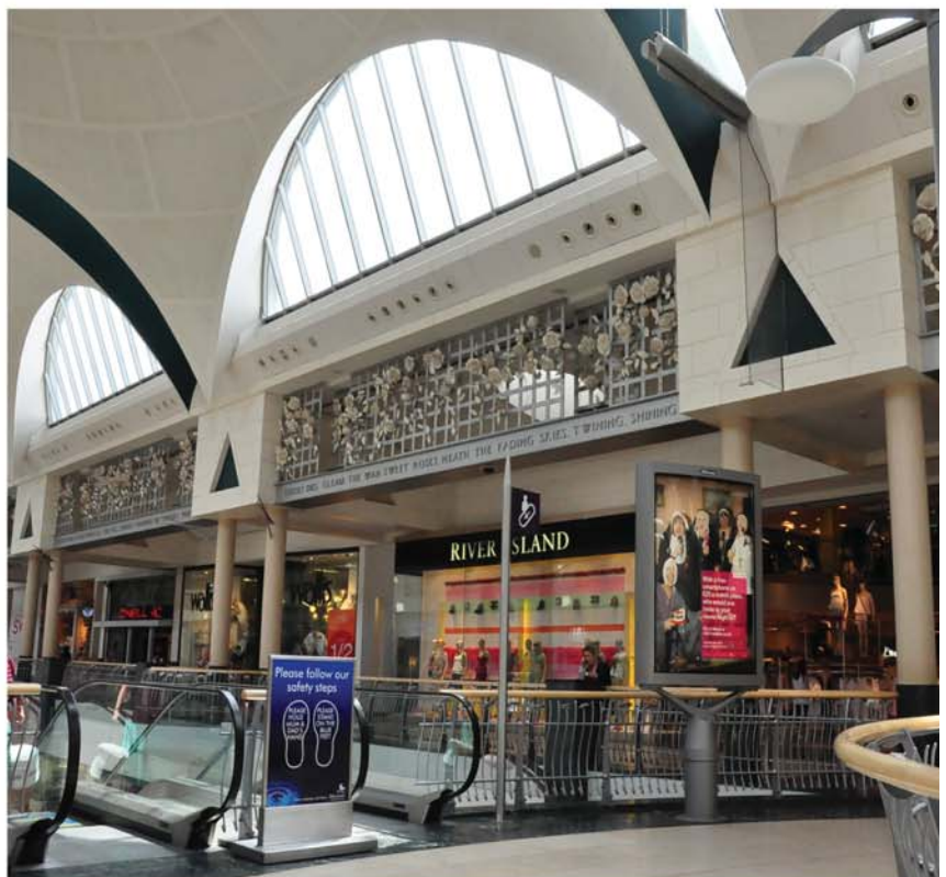
▲ Everyone liked Blue Water, Kent for its serene surroundings and artistic interiors