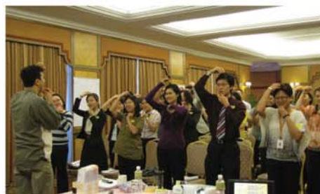
▲ Haven't done this since we were kids !