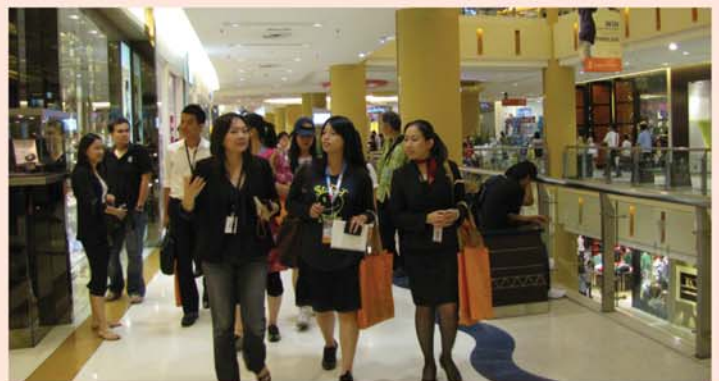
▲ Fashion glam makes site visits more interesting !