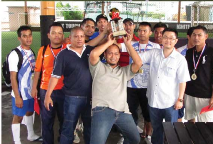
▲ Many styles, different players, one goal ..but there is only one winner, The Curve wins the Futsal Tournament !