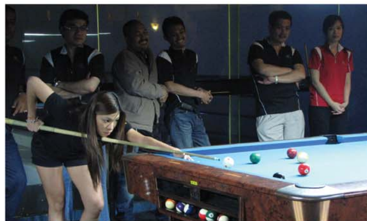
▲ Easy does it ...a picture of close concentration

Next on the calendar is BOWLING which will be held at Sunway Mega Lanes, Sunway Pyramid on 10 October– do sign up soon !