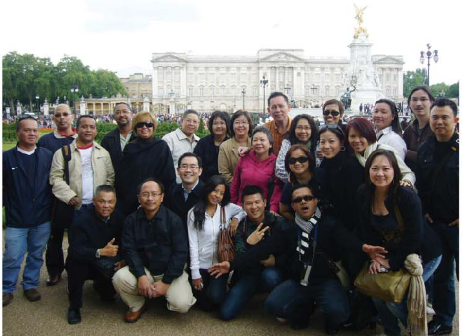
▲ One for the album – we did wonder whether the Queen would appear !