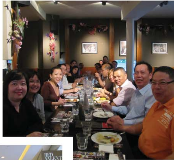
◀ We're one big happy family!