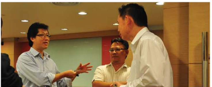
▲ Getting to know you ..