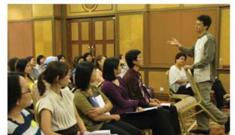
◀ Be your own 'dream-maker'