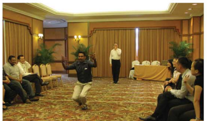
▲ Looks like this is fun (or funny) ?!