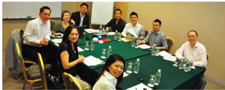
▲ The monthly committee meeting about to commence ..