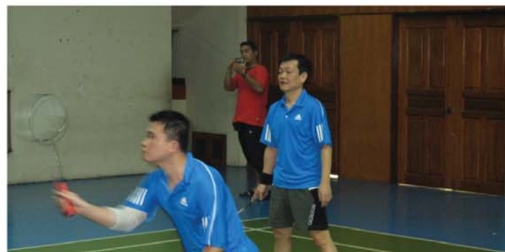
▲ The gentle touch sometimes does the trick !