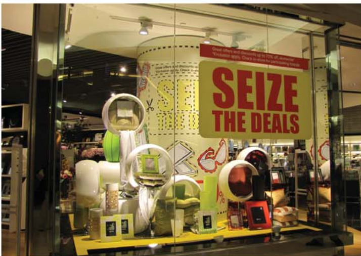
▲ Don't you wanna seize the (best) deal at Robinsons ?