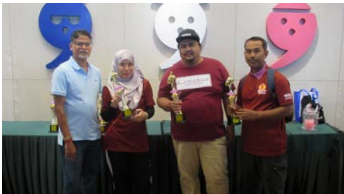
First runner-up: 1 Utama Shopping Centre