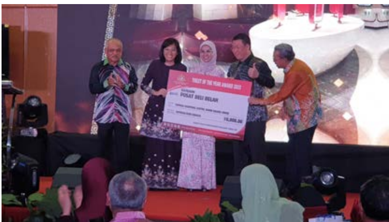
Toilet of the Year 2023

The Department of Local Government or Jabatan Kerajaan Tempatan (JKT) under the (then) Ministry of Local Government Development or Kementerian Pembangunan Kerajaan Tempatan (KPKT) organised the above in October 2023. CONGRATULATIONS to TOPPEN SHOPPING CENTRE who won the TOP Award in the Shopping Centre Category .