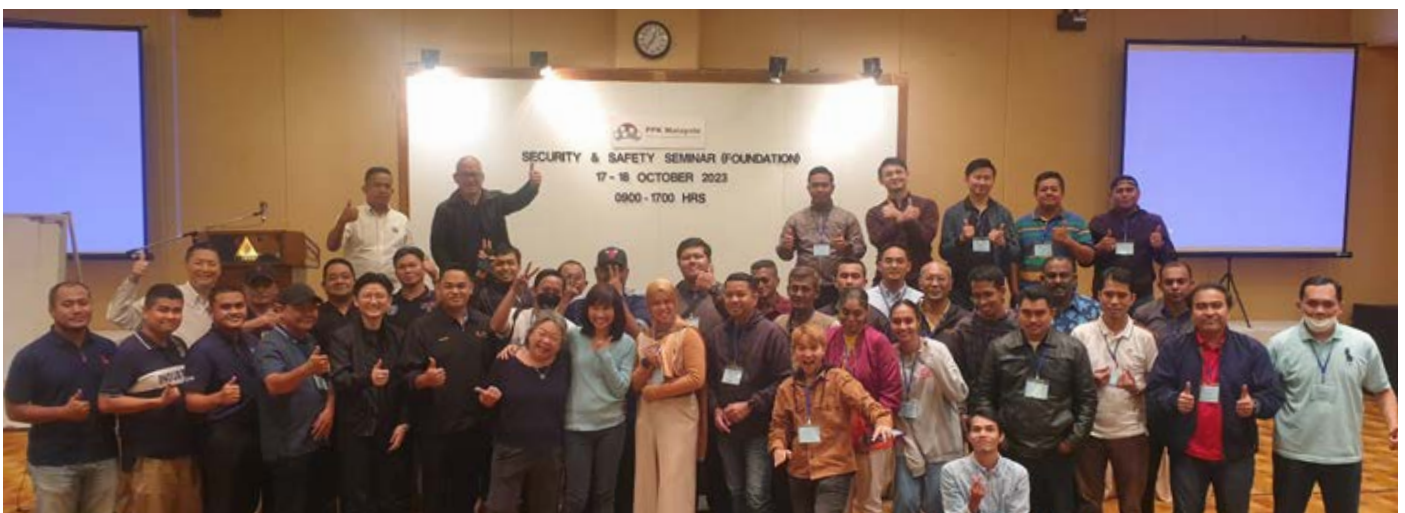
Participants found the course good sharing of invaluable experiences