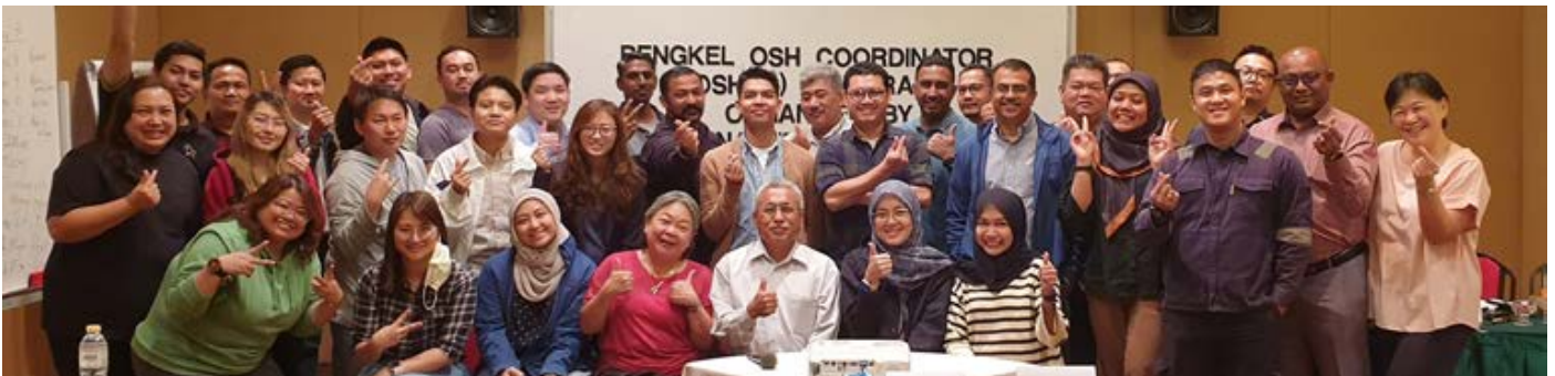
Participants from the first workshop in high spirits