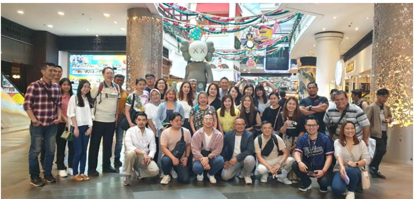
Another group photo at Gandaria City