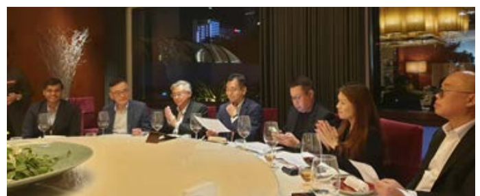
The annual CASC Board Meeting was hosted by TCSCRE at Grand Hyatt Taipei and welcomed Shopping Centre Association of India into the council.