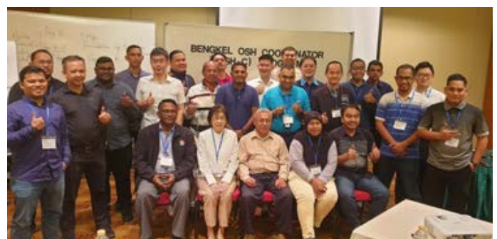
The second batch of participants also found their class rewarding