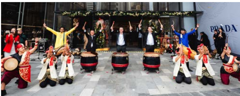
Opening ceremony on November 29 2003

Shoppers can look forward to statement stores such as Louis Vuitton, Chanel, and Gucci while essentials is the niche luxury fragrance destination for brands such as Penhaligon's, Santa Maria Novella, and Matiere Premiere.