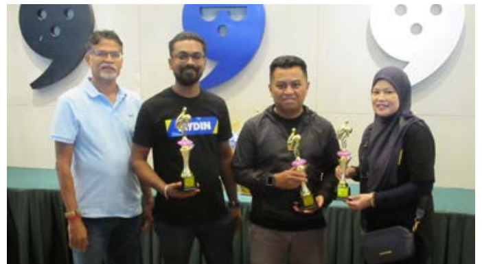
Second runner-up: Mydin Mall