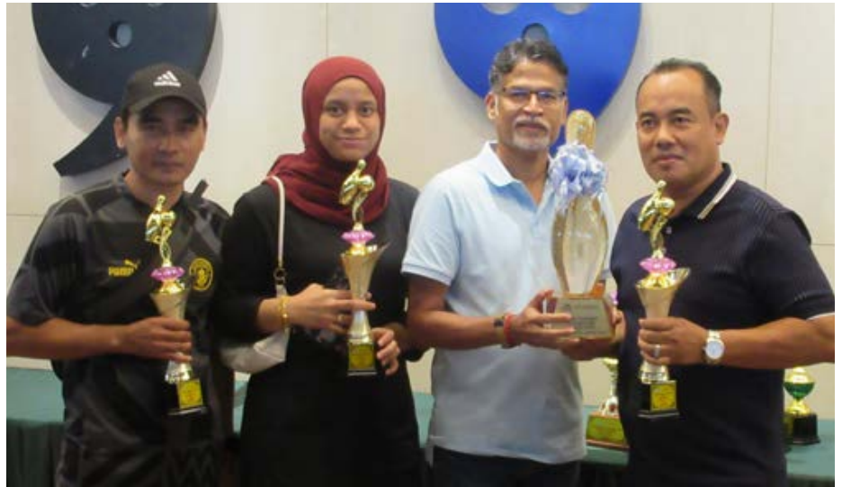
Champion: Great Eastern Mall

The competition was once again co-organised and sponsored by MesaMall, Nilai. There were 22 teams from 12 malls with the championship going to Great Eastern Mall followed by 1st runner-up 1 Utama Shopping Centre and 2nd runner-up Mydin Mall. Congratulations to all!