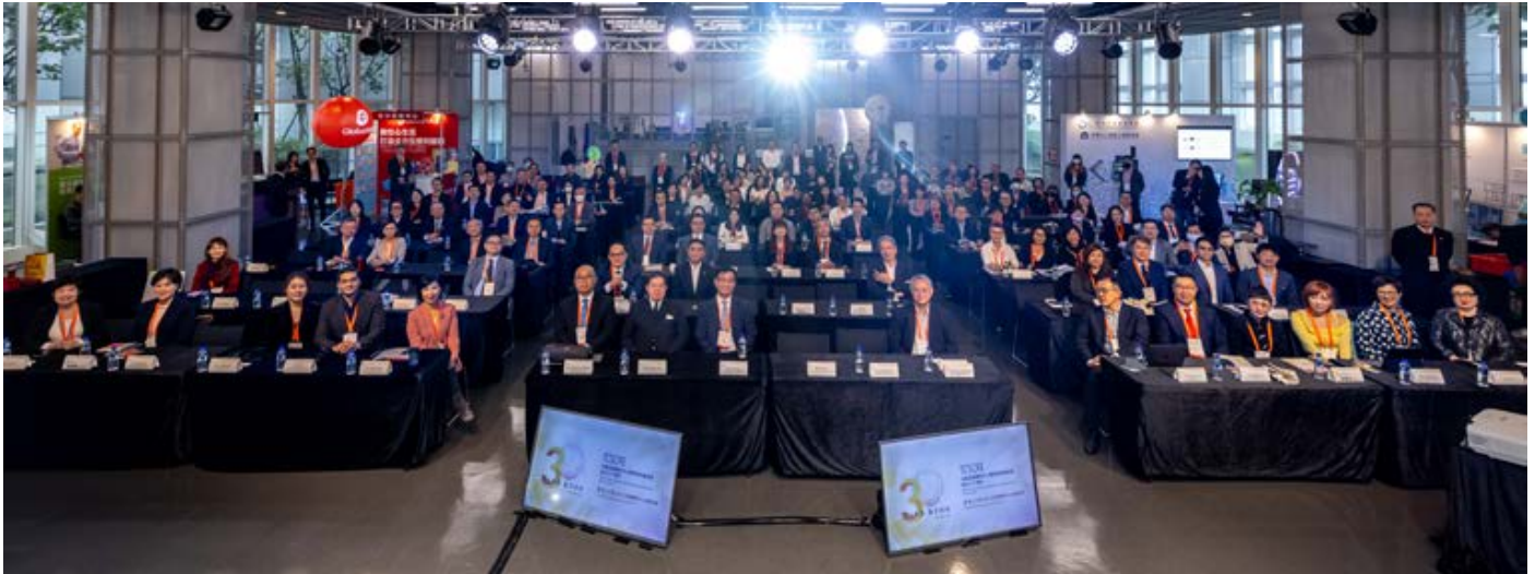
More than 200 participants attended the Taipei conference

30 NOVEMBER - 1 DECEMBER 2023 | TAIPEI, TAIWAN