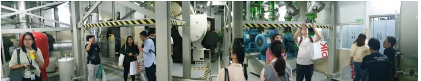
The pump room at Pantai Indah Kapuk (PIK) Mall