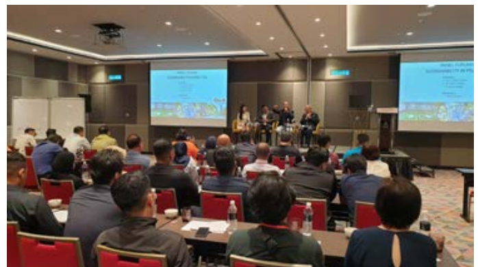
Q&A session on Sustainability in Practice