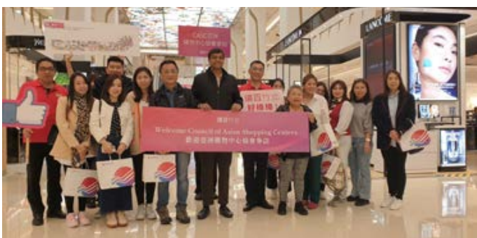
Mall visit to Far Eastern Department Store, ChuBei