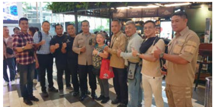
Feeling very safe with security personnel from Gandaria City