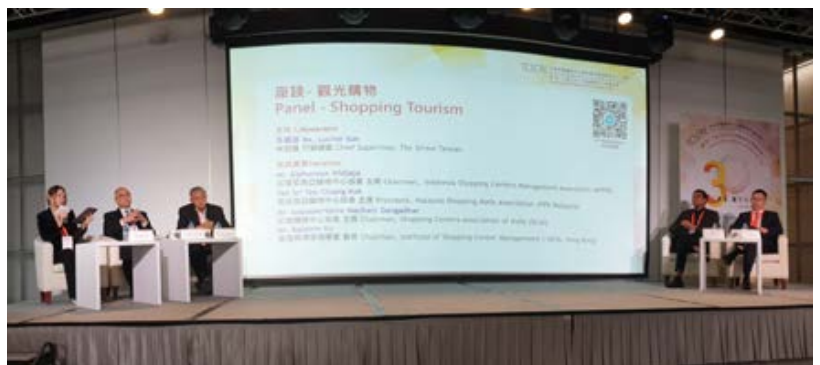
Panel discussion on Shopping Tourism by representatives from Hong Kong, Indonesia, India and Malaysia