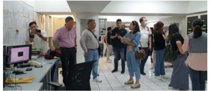
Back-of-house visit to the operations room