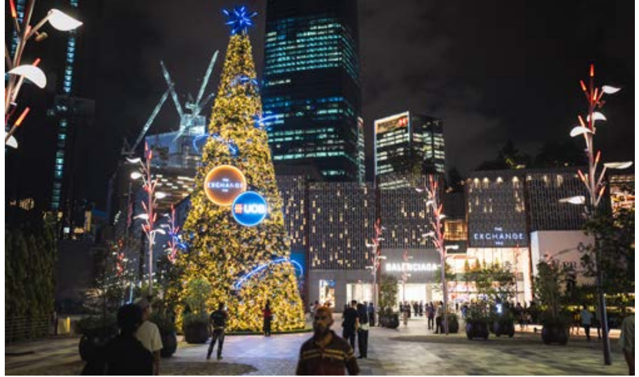
Grand entrance of The Exchange TRX

K uala Lumpur's latest dynamic retail and lifestyle destination, The Exchange TRX, has set new benchmarks for innovation, sustainability, and community-centric design. Opening its doors for business on 29 November 2023 in the heart of the capital city, it unveiled the future of experiential retail, sustainable urban living, and vibrant cultural expression.