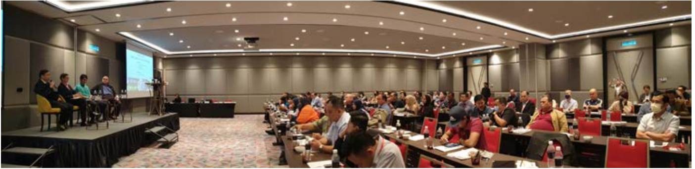
Panel session on What's New in Building Operations

Shopping mall practitioners had a great day out with our engineering partners recently in the latest edition of our joint collaboration with the Institution of Engineers Malaysia (IEM). We have been jointly organising this seminar since 2012 and the recent seminar attracted a total of 77 participants who gathered to learn from the following eminent speakers: