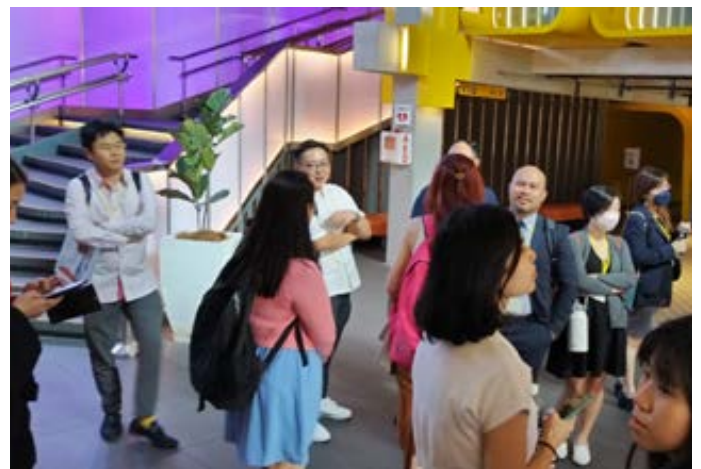
Definitely something new in a shopping mall, PJ PAC (Performing Arts Centre).