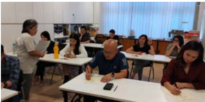
Part 3 candidates doing their written exams.