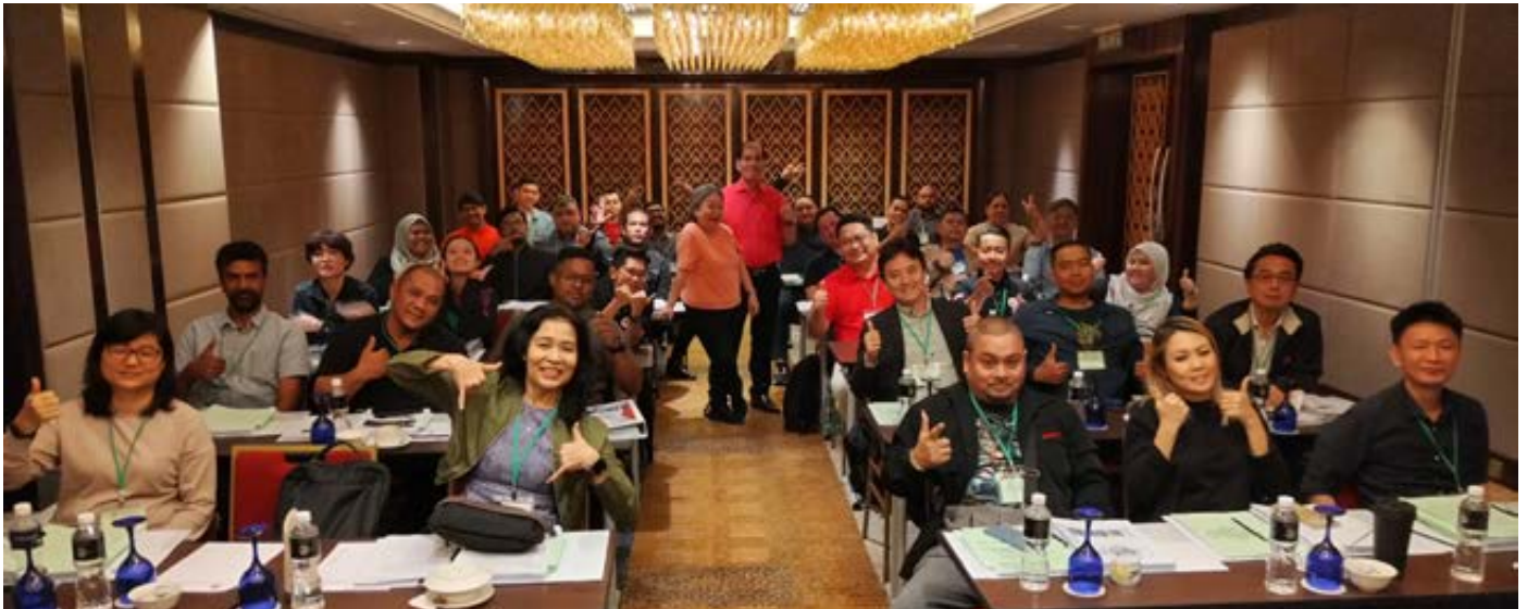
Operations & Maintenance Part 1: Happy faces = enjoyable and fruitful lessons.