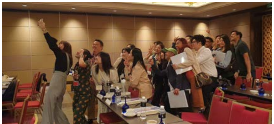
Marketing & Leasing Part 1 cohorts making one for the album.