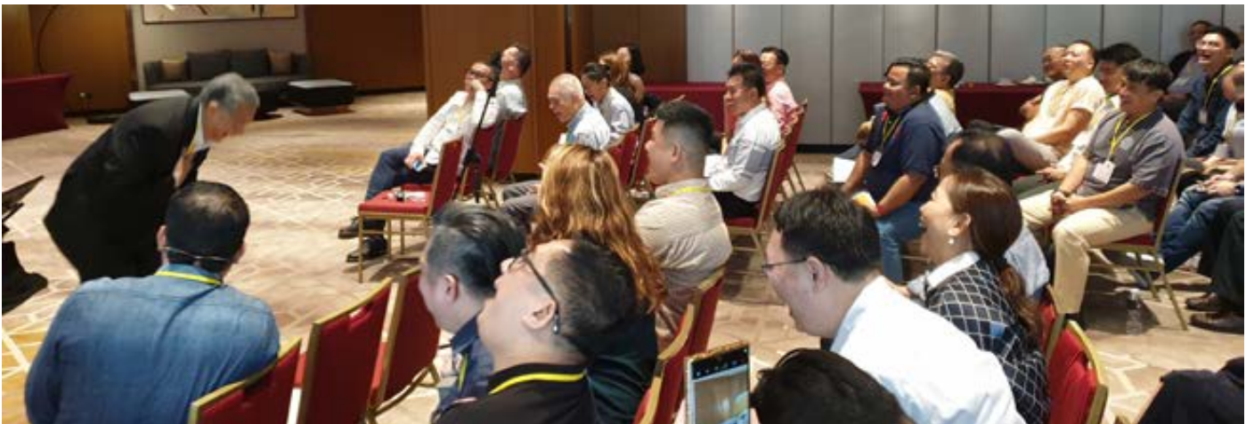
Our Immediate Past President thanking members for their love which is more than ... (!).