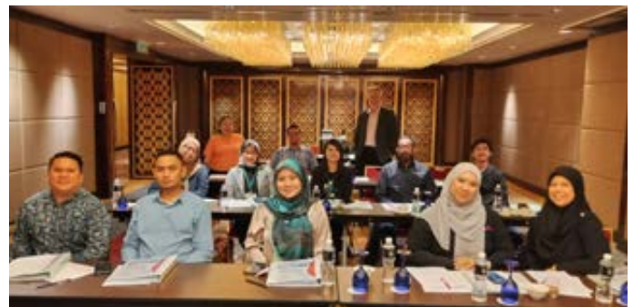
A smaller class for Operations & Maintenance Part 2 means better interaction and attention.