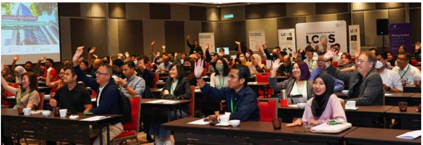
Yes, WE are sustainable!