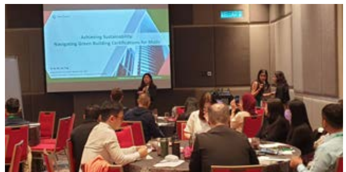
Breakout session on Navigating Green Building Certifications for Malls .