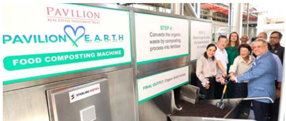
Pavilion loves E.A.R.T.H. Food Compost initiative