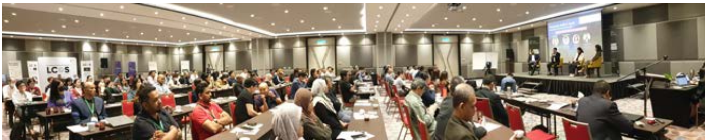
Overview of the sustainable people.

The seminar sparked insightful discussions on sustainability practices for the shopping mall and retail sectors with keynote sessions, workshops and panel discussions amongst well-experienced practitioners and experts. It was a most fruitful and useful seminar with the majority of participants believing that sustainability should be a top priority for malls. In this instance, malls should look at energy efficiency, waste management and community engagement. Overall, it was deemed 'very insightful sharing about sustainability practices in retail malls' , with some participants preferring a longer duration in order to cover more in-depth perceptions.