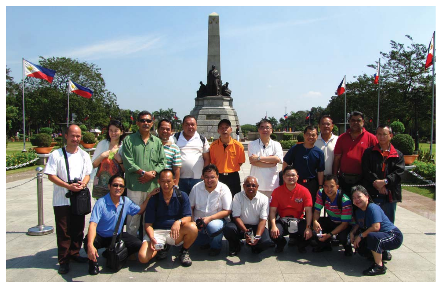
A Bright sunshine and bright faces at Manila