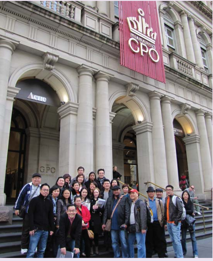
▲ Melbourne GPO, the former heritage post office is now a mall

Senior personnel from Shopping Centre Council of Australia (SCCA) in Sydney hosted a dinner meeting with PPK representatives, headed by our President. It was a fruitful discourse with to exchange industry updates and share news on shopping centre management and commercial developments.