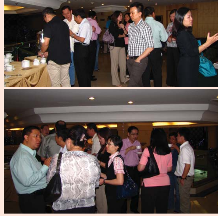
▲ Getting to know Kota Kinabalu malls over refreshments