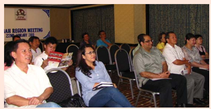
All smiles, something amusing ?!