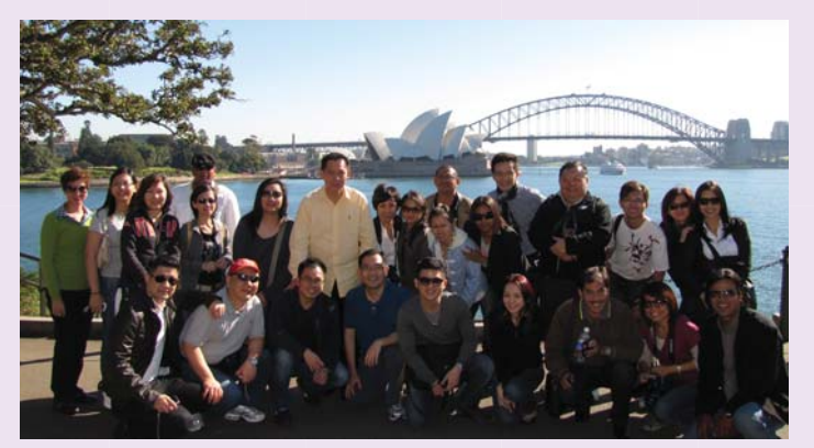
Assembling at the famous Sydney skyline

Our group embarked on a study of Australia's prominent centres in Sydney and Melbourne and found ourselves duly impressed. The hosted visits included Westfield malls, regional and CBD centres and a factory outlet, where participants uncovered excellent bargains. The shopping scene was bustling and vibrant with many things to be learnt from specialized customer services, impressive architectural designs, interior décor and lighting. All agreed that it was a fruitful and fun trip, with time out for a quick tour in both cities and sampling local delights, plus an excellent time for info-sharing and networking.