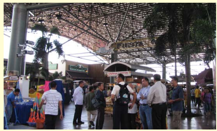
Technical visit at Market! Market!